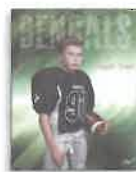
8x10 ProMetallic (printed on high def photo paper)