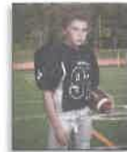
1 - 8x10 Individual