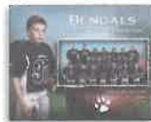
1 - 8x10 SportsMate