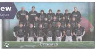
10x20 High Definition Team Poster