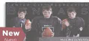
5x10 Varsity Print (Poses may vary)