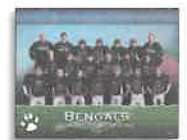
8x10 Team Portrait