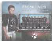
1 - 8x10 SportsMate