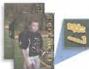
2 - 5x7 Personalized Prints (includes athlete's name & number)